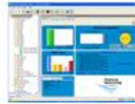
ProCurve Manager 2.3