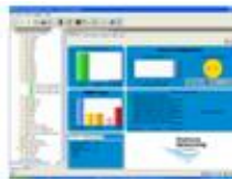
ProCurve Manager 2.3 (-)

ProCurve Manager is a Windows-based network management solution that is a free downloadable software from the Web and is in-box with selected manageable ProCurve devices. It provides all the basic tools needed to handle a network effectively, along with a 30-day trial version of ProCurve Manager Plus 2.3.